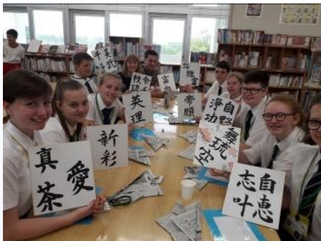
Kenyan — Student Exchange