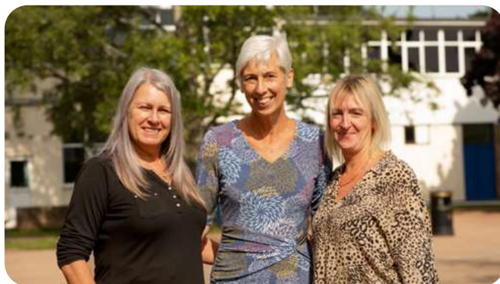
Our Student Support Mentors work with all students, liaising with families and external agencies